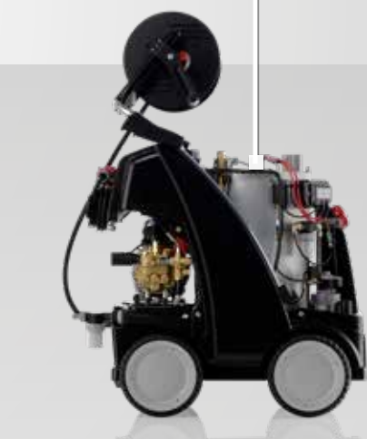
# 626210 therm-CA 12/150

POWERFUL ENTRY MODEL with all important basic functions